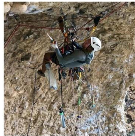
$450 = One Route Replaced