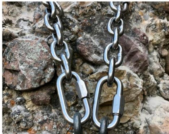
$125 = Top Anchors Replaced