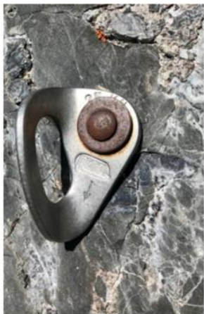
$35 = One Bolt Replaced